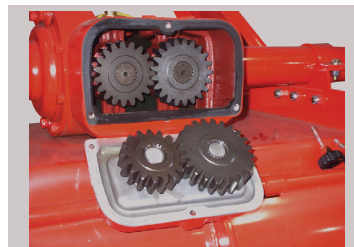
4 speed gearbox