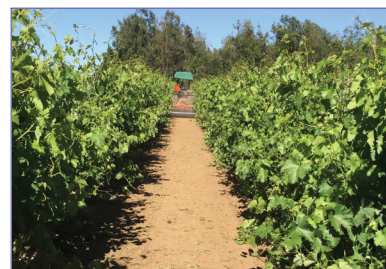
Tills, levels and rolls out the vineyard floor