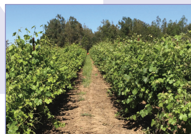
Uneven, compacted, weedy vineyard rows

The all-in-one implement that tills, weeds, levels, incorporates pruning chips, reduces compaction, and lightly firms the soil. Tractors make many passes in the vineyard throughout the year with even heavier equipment, which can cause deeper ruts and compaction. Our S Series Vineyard Incorporators leave the soil in a smooth and level condition which improves appearance and helps prevent future floor damage.