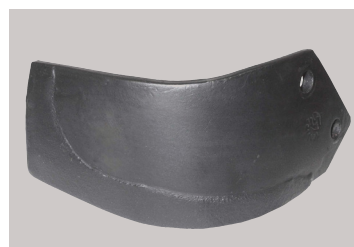
Tungsten coated tines